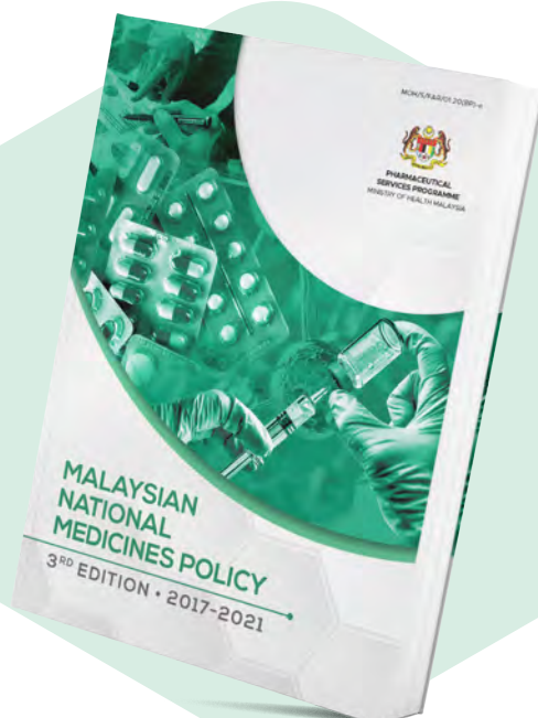
Malaysian National Medicines Policy (MNMP)